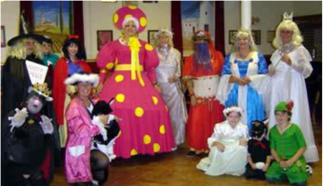
CAODS at Cowes Carnival, 2006